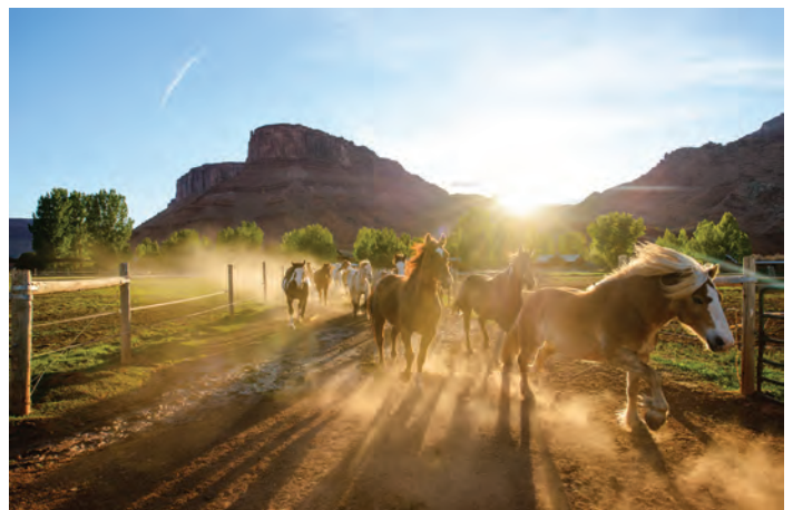
Sunset at the Ranch