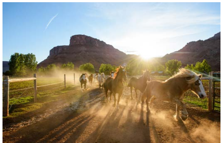
Sunset at the Ranch